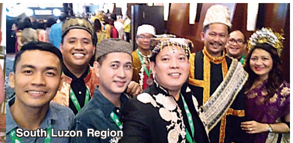
South Luzon Region