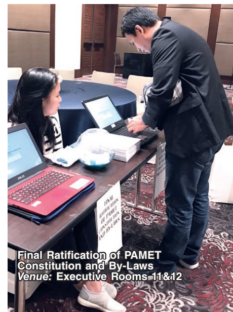
Final Ratification of PAMET Constitution and By-Laws Venue: Executive Rooms-11&12

In recognition of their contribution, the 53rd PAMET Annual Conference acknowledges with deep appreciation the tremendous efforts of all the organizing committee and all the participating stakeholders who have contributed towards the successful global events of Filipino Medical Technologists.