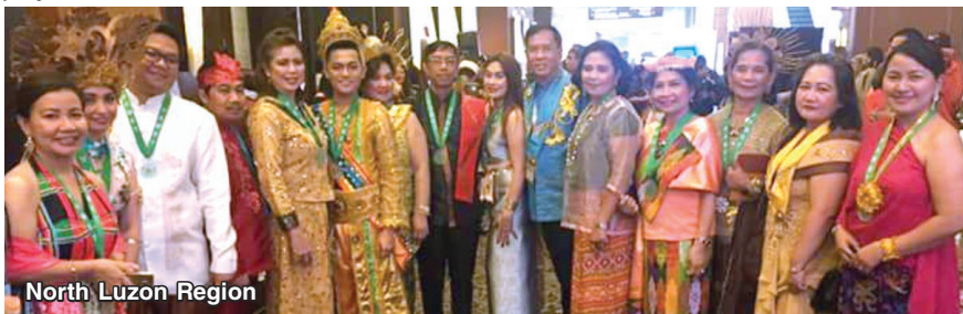
North Luzon Region

The 53rd PAMET Annual Confab formal opening ceremonies started with a bang through the symbolic processional of the leaders of the association that truly exudes the binding commitment of leadership, including the Chapter Presidents, National Past Presidents, Regional Directors, current National Board of Directors and Officers and Keynote speaker. The ASEAN inspired costume symbolizing countries highlighted the traditional march of